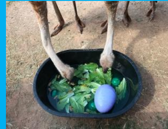
Content submission by Holly R.

Below, OKC's ostrich pair dunk for submerged treats